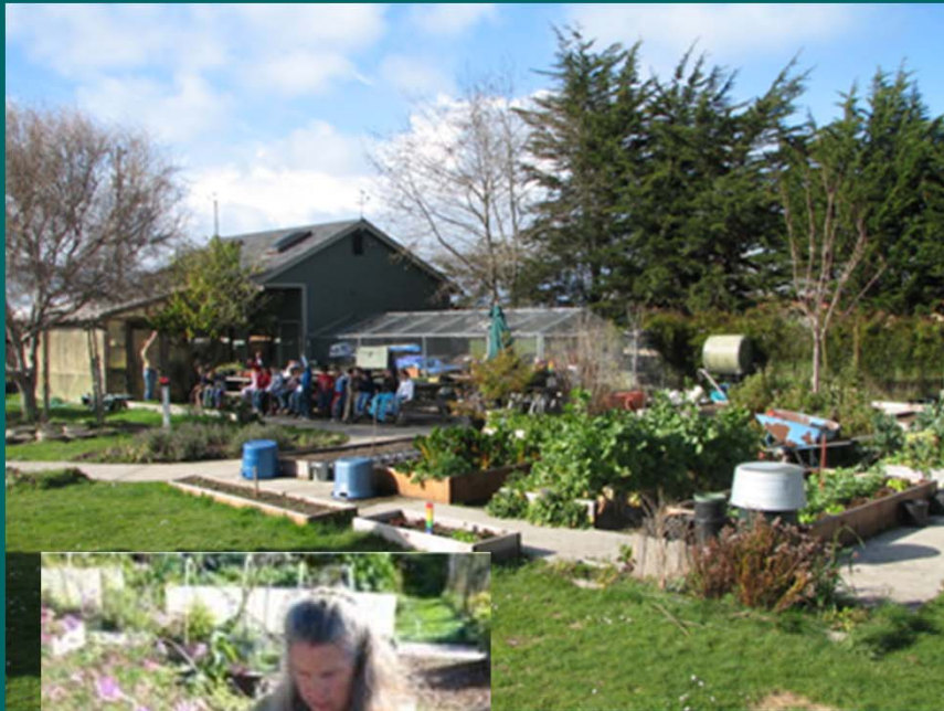
Dana Gray Elementary Fort Bragg